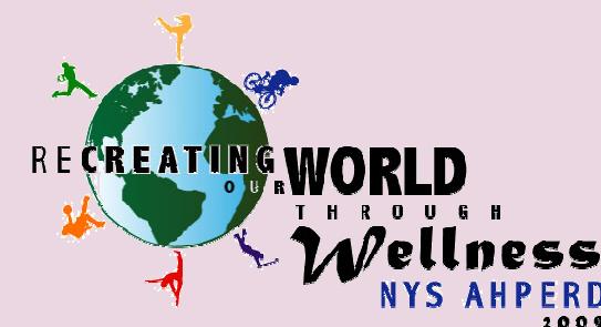
Exhibit Show Dates