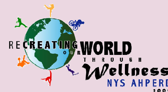
Exhibit Show Dates

72 nd Annual Conference College/University Exhibitor Information & Policies